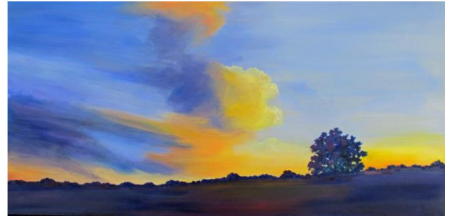
FROM THE WEST – acrylic on canvas 16 x 30"