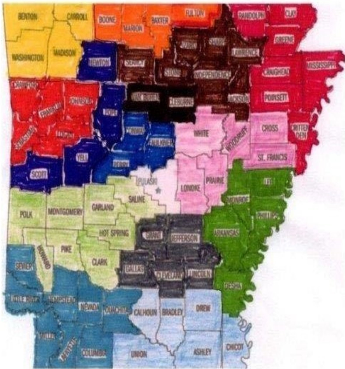
REGIONAL ADVISOR AREA MAP