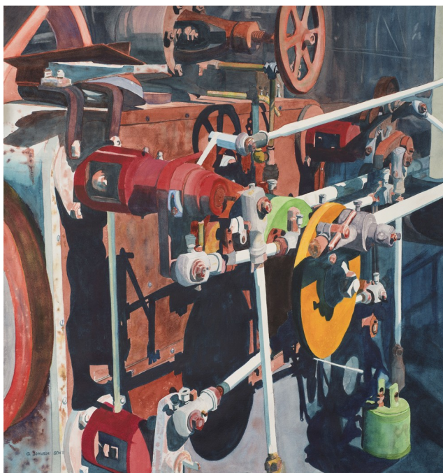
"Shadows from a Bygone Era"